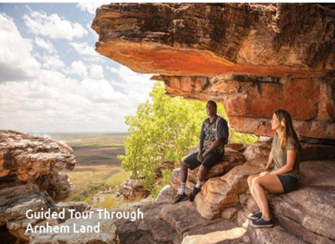
Guided Tour Through Arnhem Land