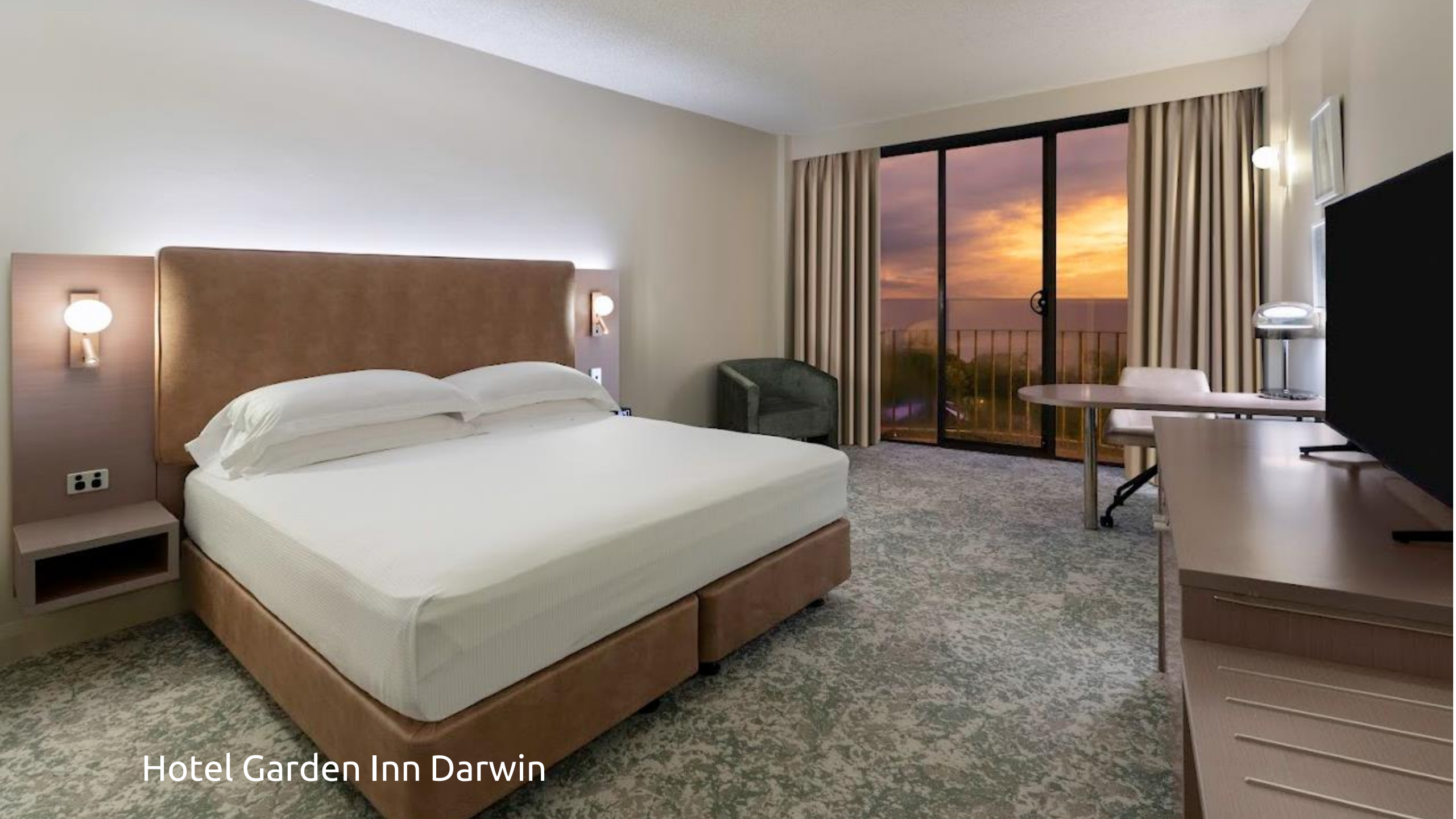
Hotel Garden Inn Darwin