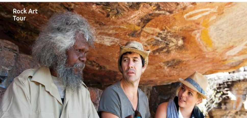
Rock Art Tour