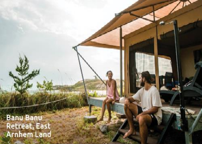
Banu Banu Retreat, East Arnhem Land