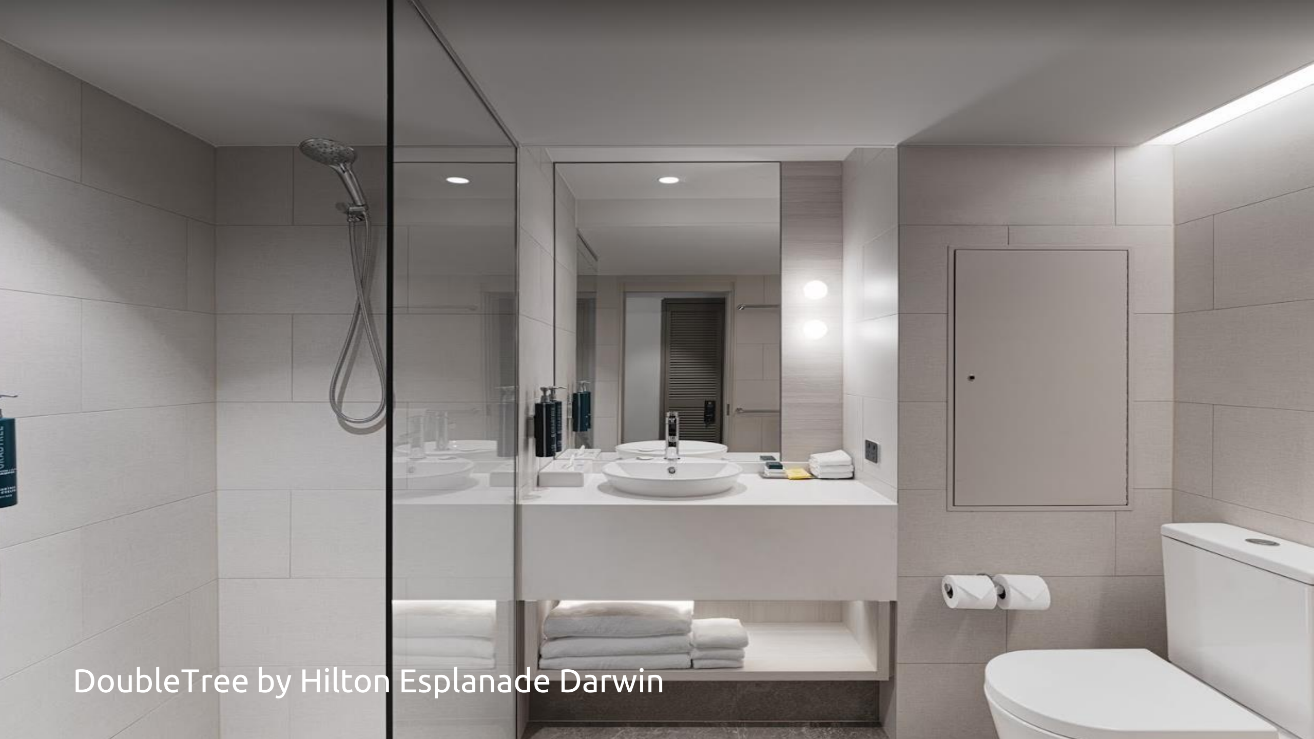
DoubleTree by Hilton Esplanade Darwin