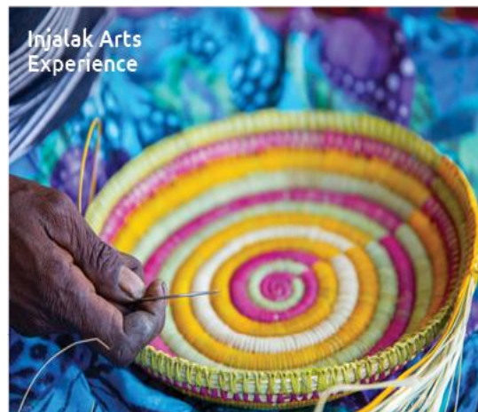
Injalak Arts Experience